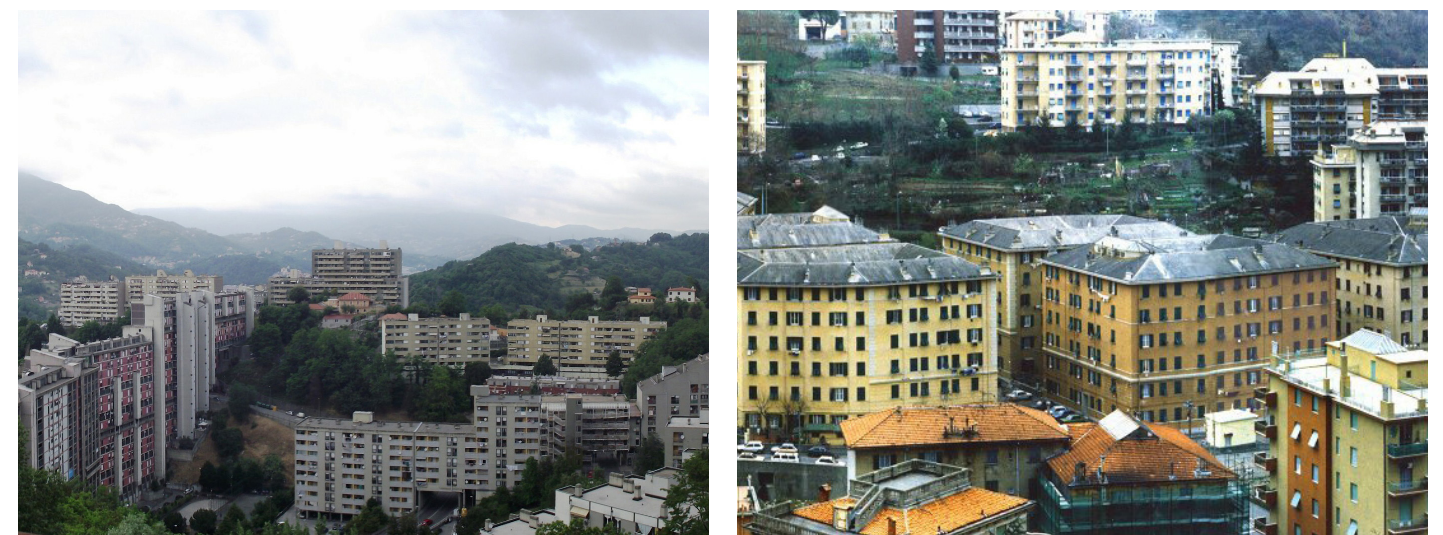
Quartiere Begato (left) and Quartiere Sertoli (right)

EnerSHIFT ventured an innovative tender call providing for a self-sustainable EPC model bankable for ESCOs and replicable for Public Administrations: the call was published in August 2017, concerning a